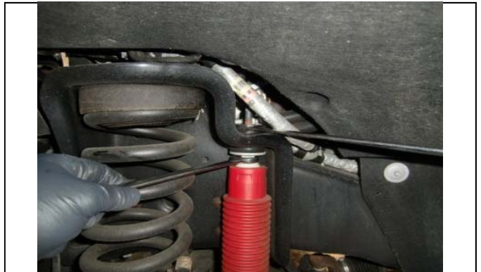
Remove front shocks. Note: Longer shocks required