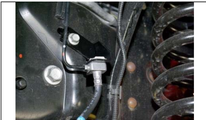
Reinstall block into bracket with retaining clip.