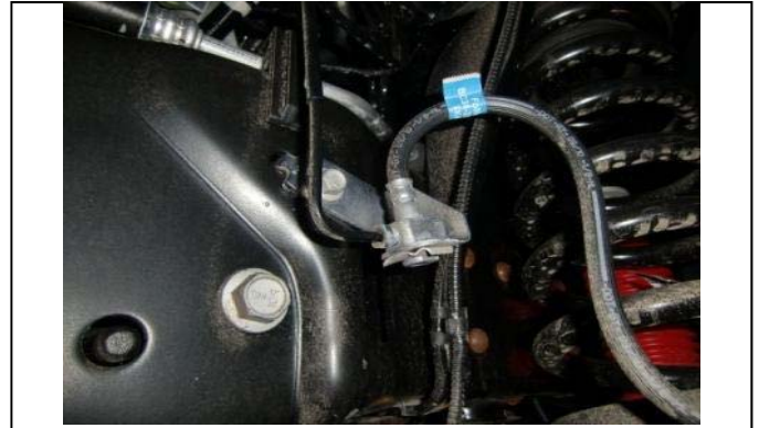
(11-up) models replace OE bracket with new drop bracket.