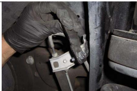
Install drop bracket and attach to frame with OE hardware.