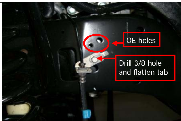
Shown, pass. side new 3/8 brake line hole location.