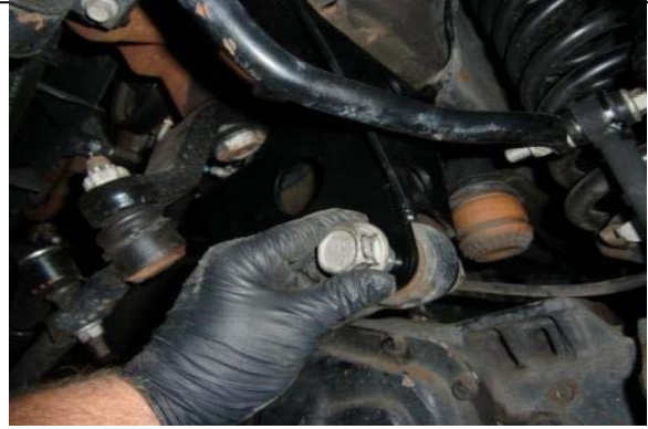
Reconnect track bar to new drop bracket w/ OE hardware.