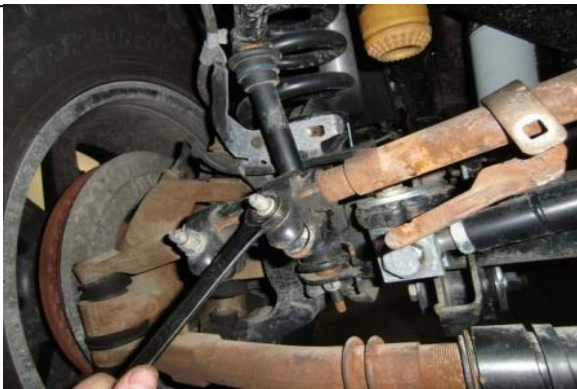
Loosen (2) collar bolts and lube threads of steering linkage