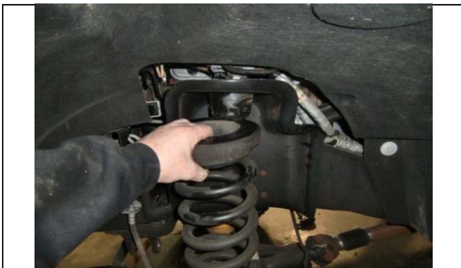
Carefully lower front axle and remove front coil springs.