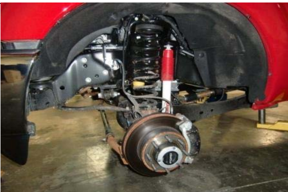
Remove front wheels and tires.