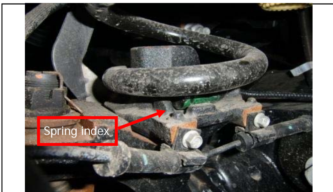
Raise axle and clock coil spring on lower mount as shown .