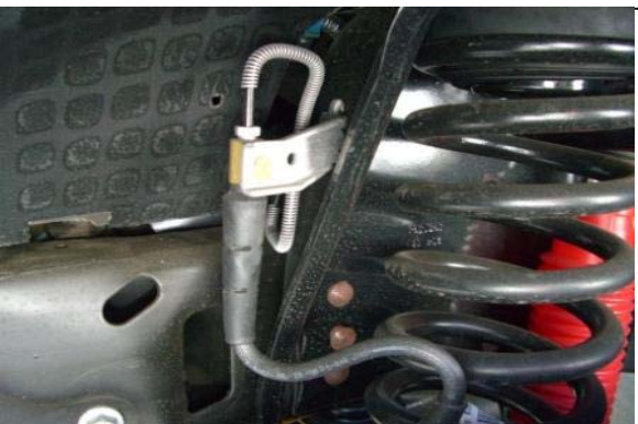
(05-07) models remove brake line brackets at the frame