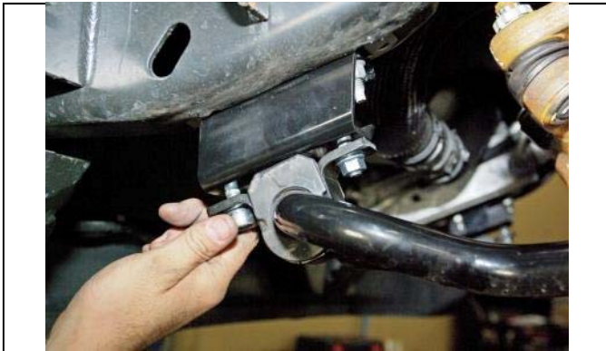
Raise sway bar and attach with new hardware.