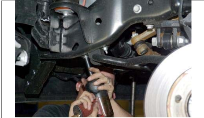
(11-up) Disconnect sway bar at frame and lower