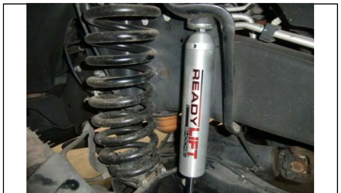
Install and tighten new shock kit 99-2095F