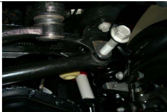
Remove upper track bar hardware and disconnect at frame.