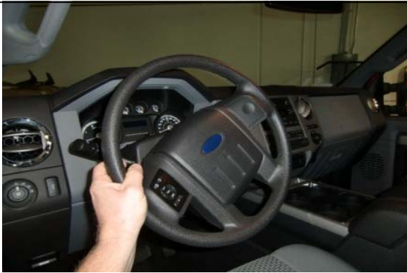
Straighten steering wheel steps, Unlock steering wheel