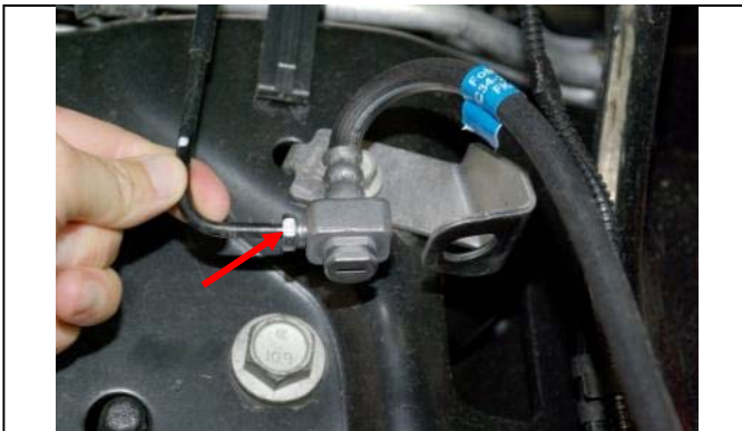
Loosen hard line ferrule rotate block 180 degrees and tighten