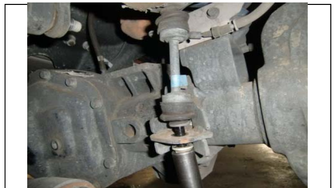
Disconnect both front sway bar end links