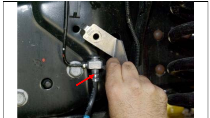
Note line direction, replace OE bracket with new drop bracket