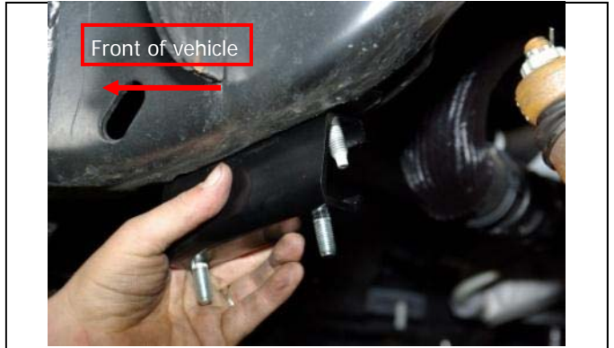
Install provided drop brackets to frame with OE hardware.