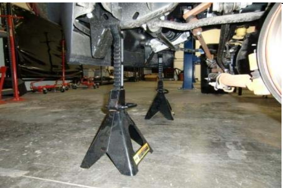
Lift front of vehicle and support with min. 3 ton jack stands.