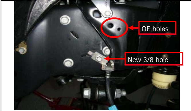
Shown, dr. side new 3/8 brake line hole location.