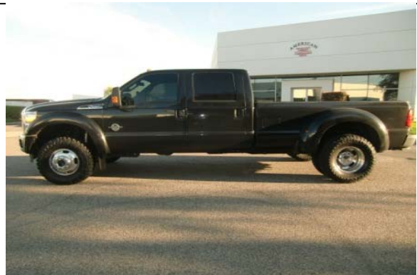
Shown '11 F-450 4WD Dually