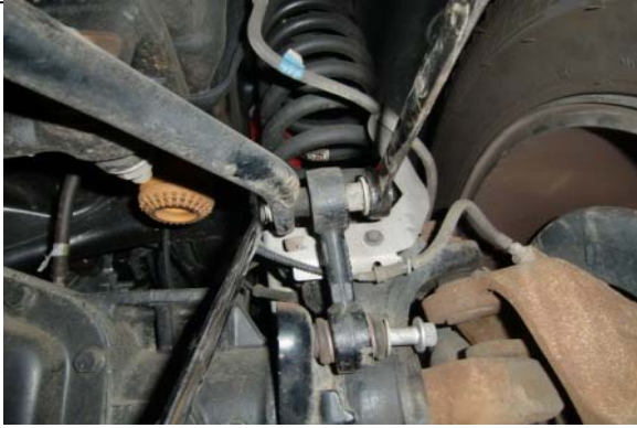
Lower vehicle, reconnect sway bar end links