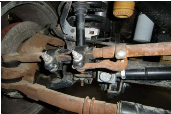
Tighten up hardware and replace keeper bolt