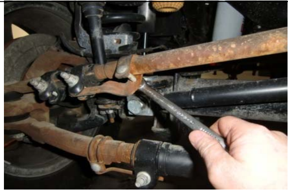
Remove safety keeper bolt and slide bracket out of collar