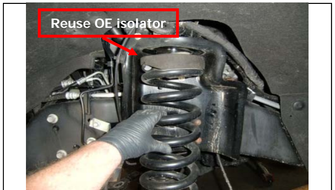
Raise vehicle enough to install new coil springs w/OE isolator