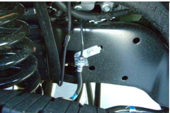
(08-10) models require drilling new 3/8 hole below OE hole.