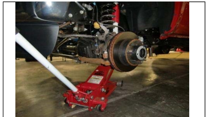
Support front axle with floor jack(s).