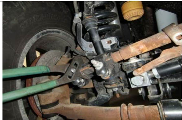
Adjust collar to straighten steering wheel